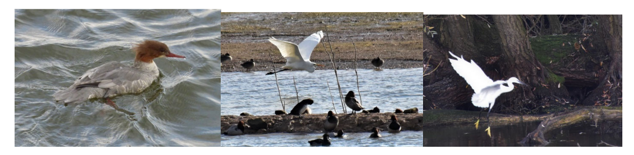
Goosander by Graham

Mallard, Pochard, widgeon, tufted duck, teal, goosander, great crested grebe, little grebe, great white egret, little egret, heron, cormorant, kestrel, lapwing, Canada geese, greylag geese, Egyptian geese, curlew, bar tail godwit, redshank, starlings, goldfinch, chaffinch, pied wagtail, swans and three types of gull. Oh, moorhens and coots, of course.