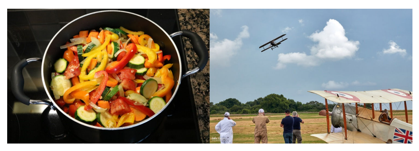
Food Norman Grove

We started the meeting by watching a slide show of the photos taken by our members during the month. The subject for the month's assignment being "Photographs where the subject starts with the letters "E and F". A total of 39 photos were submitted including some from members who were unable to attend.