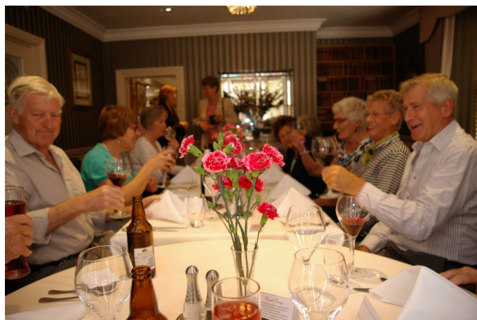
The Luncheon Group at Lunch