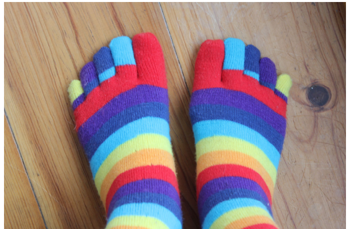
Stripy Socks: Author – Linda Wilks

The assignment for June was a photo taken from an unusual angle. This subject proved to be harder than it at first appeared. The images included: a broom head; a row of bicycles; plants; buildings taken with the camera twisted; the underside of boats and cars; and a pair of stripy socks with toes!