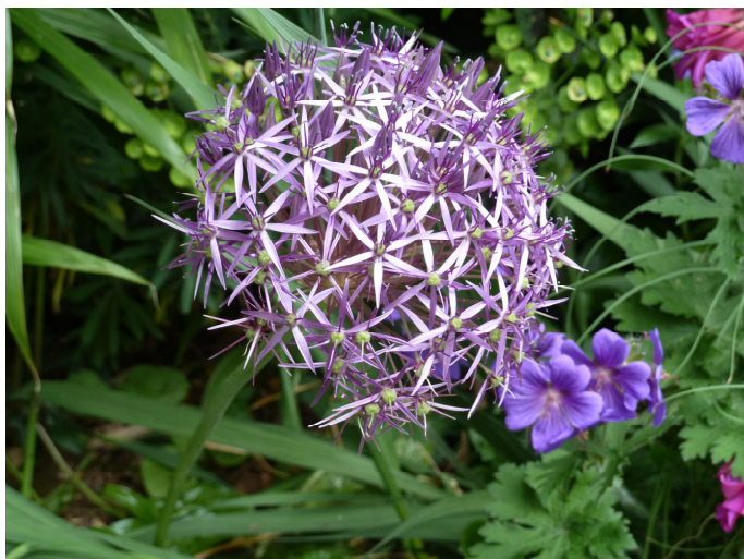
Allium. In The Round: Author Ian Newman

It was a very chilly and windy day in Burnham for the Moroccan garden, but they had lots of cosy places to sit, where we enjoyed our tea and cake, and didn't want to leave. The houseboat was something completely different, although some of us were more interested in peering through the windows than in the planting!