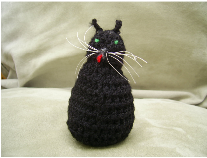
Crochet Cat: Author Pat Newman

The next meeting is on the 2 nd of July.