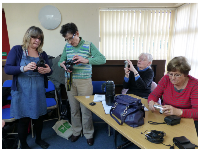
Members setting cameras

If you are interested in digital photography, come and join us. You will be made welcome whether you are completely new, experienced or just want to find your "photographer's eye". Our aim is to enjoy and to improve our photography, together.