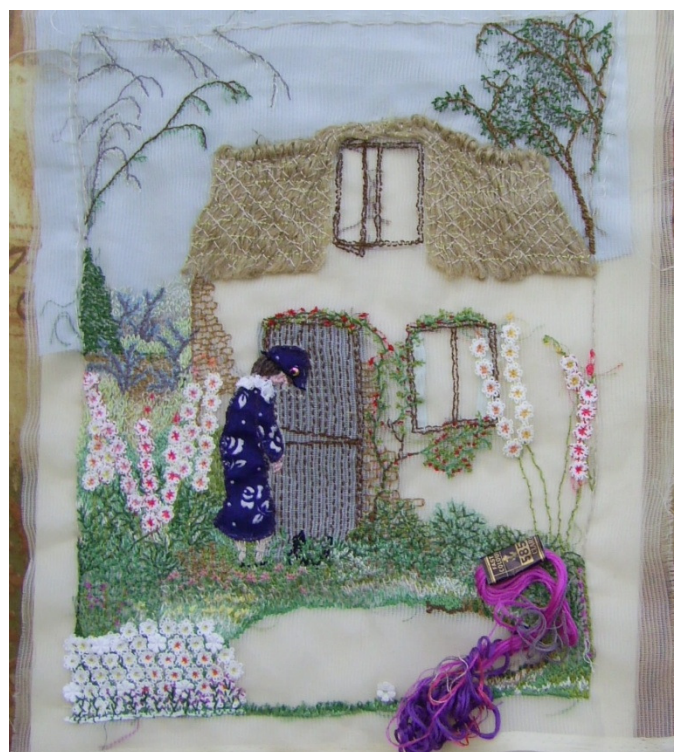
Embroidery on net: