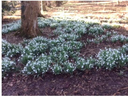
Snowdrops Yvonne West

I missed the snowdrop walk as I was ill, but I'm told it was very enjoyable, a rare sunny day with the snowdrops looking beautiful.