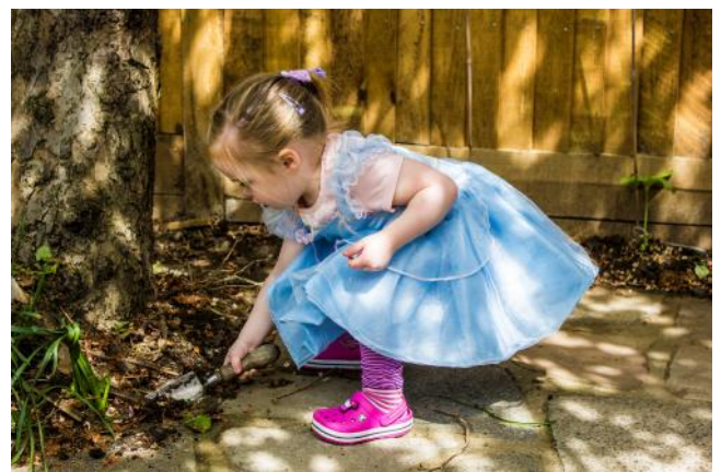
Favourite photograph. Author: Linda Wilks

It was with great relief that the totally different venue proved ideal and met the specific requirements we wanted (low light for projection). As with every big change one has to adapt to the new circumstances. We meet in the conference room on the second floor of the museum. The route to the room is through the exhibits and is similar to finding the checkout at Ikea. Fortunately there is a lift which simplifies navigation. The room is well equipped and we can alter the layout to suit ourselves. The staff are very friendly and welcoming and I am certain that we will soon feel at home in our new surroundings. On January 2 nd and with the support of fifteen members, we got our first meeting off to a flying start. We tested the projection by viewing a slideshow of our photographs. The collection had over 100 images with contributions from every member. We were unable to discuss every picture in the sequence because of time constraints, but we will pick-up where we left off and look in detail at every shot in February. We chose as our assignment for the next meeting, to photo edit a picture and to demonstrate the before and after images. The indoor assignment was chosen to overcome getting cold and soaked, out and about looking for photographs in the anticipated January weather.